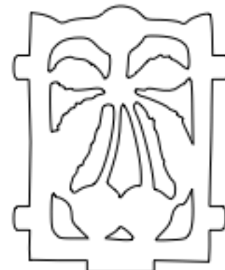
Short Side (B) x2